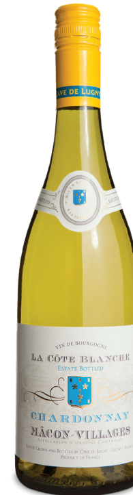
La Côte Blanche