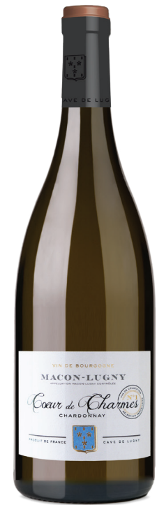
Coeur de Charmes